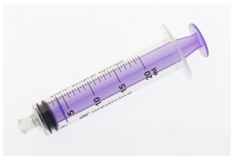
The oral syringe is purple in colour and is only for giving medicine by mouth